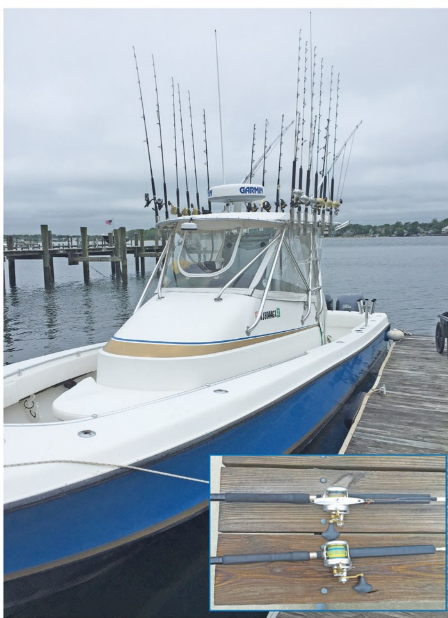
Capt. Fred runs a 31FA Contender with twin 250 4-Stroke Yamaha engines, which has logged over 150 offshore runs. The boat has been able to handle rough seas and get them home safely, yet fly to the canyons in just over two hours when conditions permit!

INSET: Whether you're fishing for dolphin or jigging or chunking tuna, you need the right rods and reels for the job.