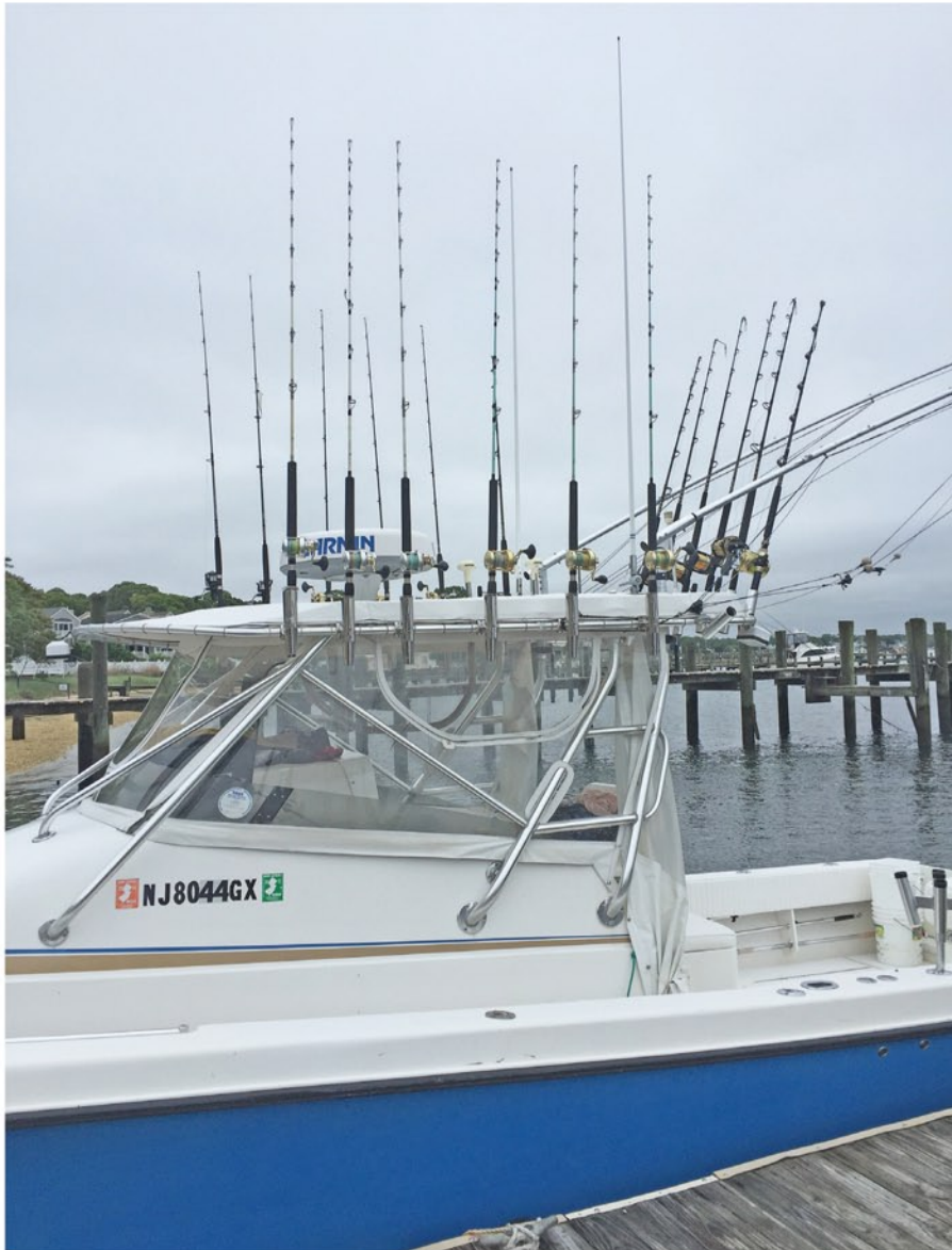
By adding an extra 10 rod holders to the T-top Capt. Fred can take setups that are not in play and get them out of the way, yet be able to reach them quickly if he needs them back in the game!

been much I have done to the motors to enhance performance, but have made some adjustments that have made the offshore trips that much more efficient.